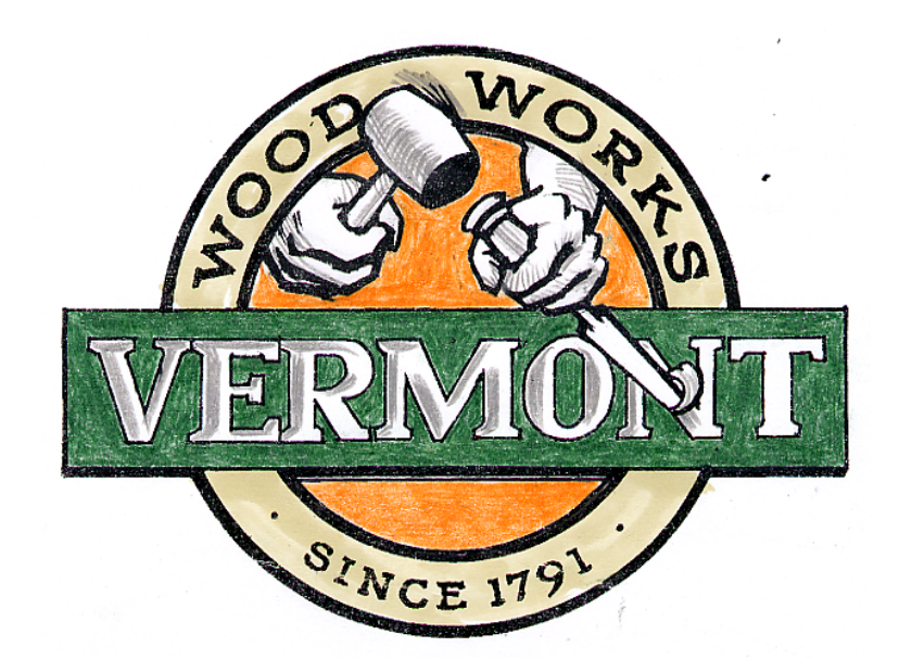
New England Craftsmanship Since 1791